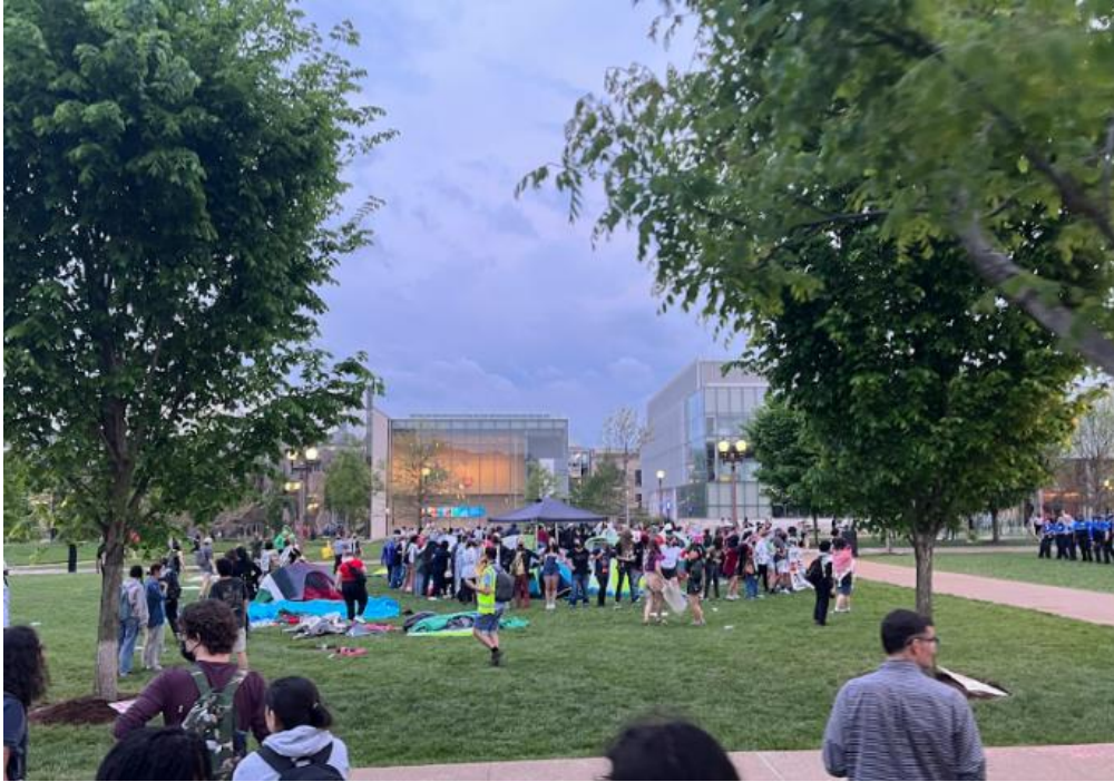
Photo of the protest at Tisch Park.