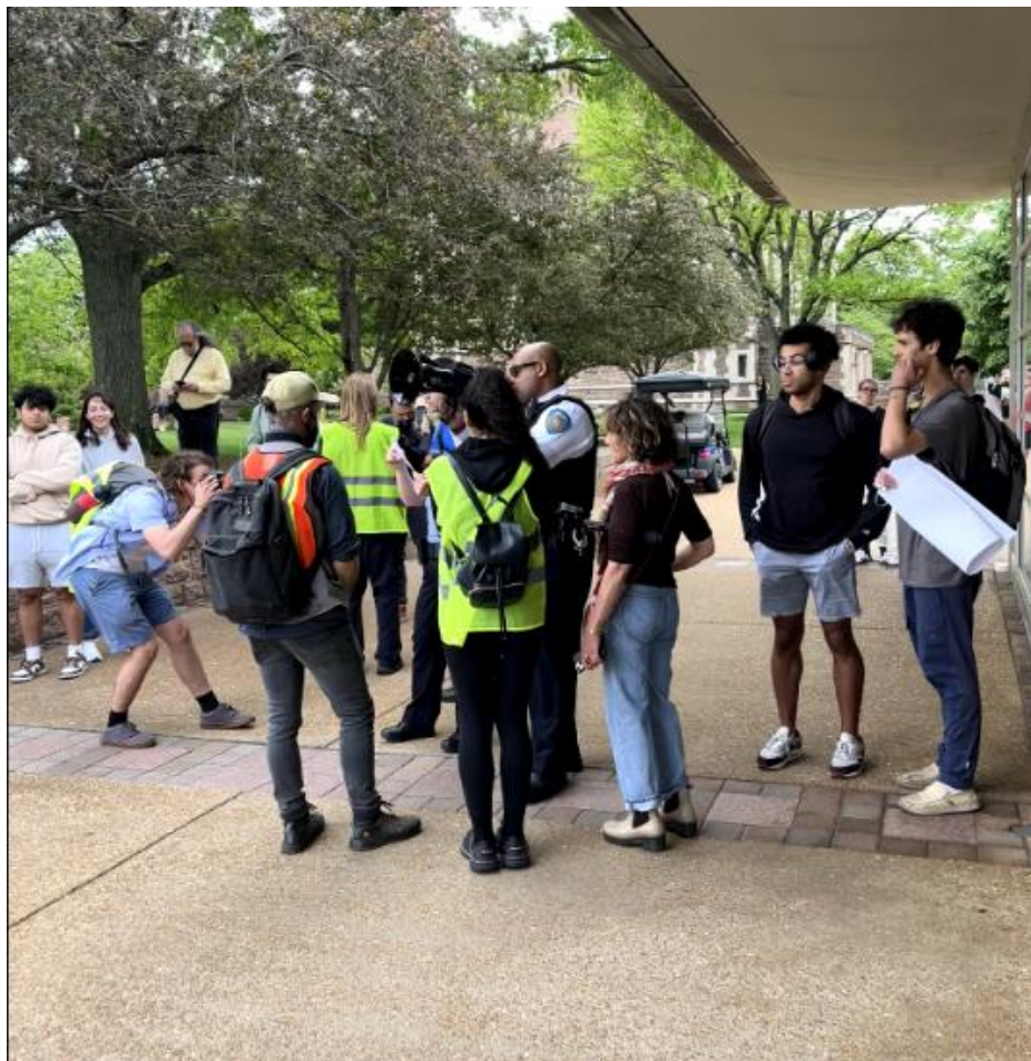
Photo of WUPD Officer delivering a dispersal order outside of Olin Library.