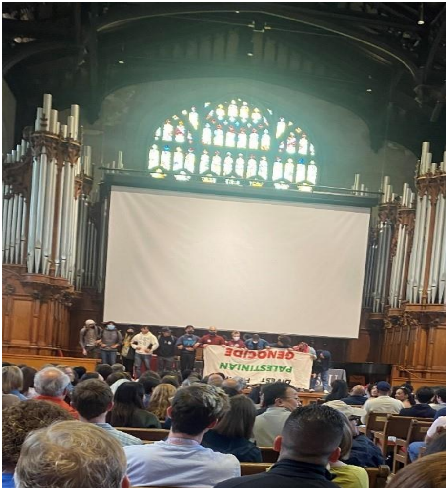
Photo of protestors on stage at Graham Chapel.