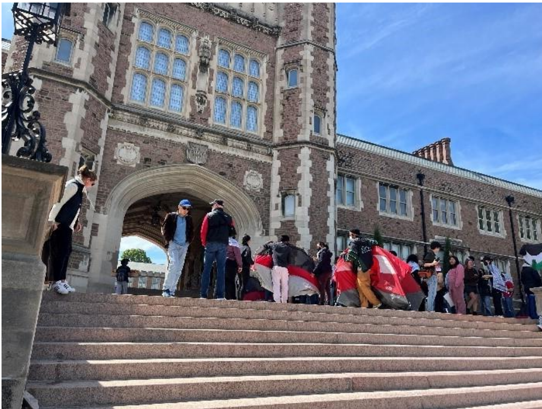
Photo of demonstrators erecting tents on the steps of Brookings Hall on April 20, 2024.

At approximately 1:30 p.m., some 50 demonstrators gathered in the Brookings Quad area. The group was smaller than the crowd of protestors on April 13 and appeared to be a mix of WashU students and individuals unaffiliated with WashU. The protestors gave speeches, chanted and held signs containing statements regarding the Israel/Gaza conflict and WashU's alleged investment in Boeing. When the demonstrators attempted to erect tents outside the Brookings archway, the D&D team told the protestors that this violated University policy, and told them to disperse. The protestors refused, and the matter was turned over to WUPD.