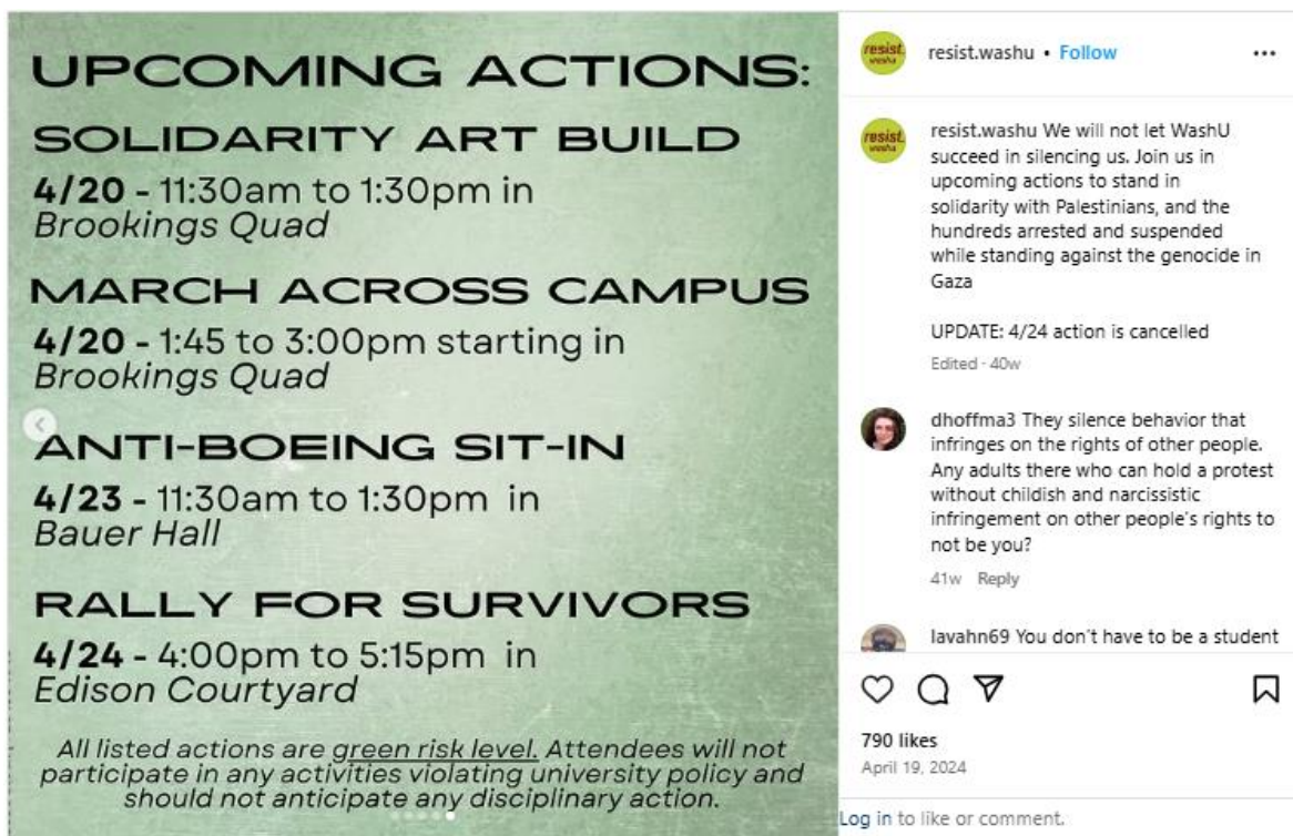
Screenshot of Upcoming Actions Instagram post by @resist.washu.

After the April 13 protest, the Administration was concerned about the potential disruption of two major campus events planned to occur on April 20 – the ThurtenE Carnival and an alumni reunion. To prepare for a possible disruption, the Policy Group, consisting of members of the Chancellor's Cabinet, met and developed a written de-escalation plan for responding to, and managing, future demonstrations on campus. While the prior protest was unexpected, University administrators and WUPD had intelligence that new protests were being planned for April 20. Groups like Resist WashU and St. Louis Palestine Solidarity Committee posted several messages on social media announcing events that were planned to take place on WashU's campus on April 20, including an "Art Build" and a "Divestment Rally."