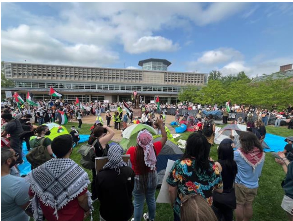
Photo of demonstrators surrounding George Washington statue.

and Brookings Quad. They finally assembled outside the south side of the Olin Library, gathering around the George Washington statue. At approximately 4:00 p.m., the protestors began setting up an encampment, laying down blue tarps and erecting tents. One protestor climbed the George Washington statue, placed a Palestinian flag under its left arm and draped a kaffiyeh around its neck. The faculty member who was interviewed as part of this Review participated in the protest, but stated that he did not expect tents to be part of the protest. He noted that some protestors left when the tents were brought out.