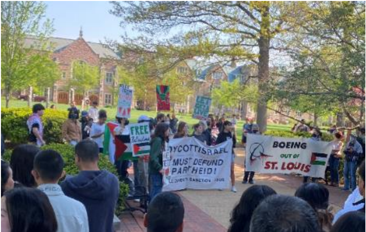
Photo of protestors outside of Graham Chapel.