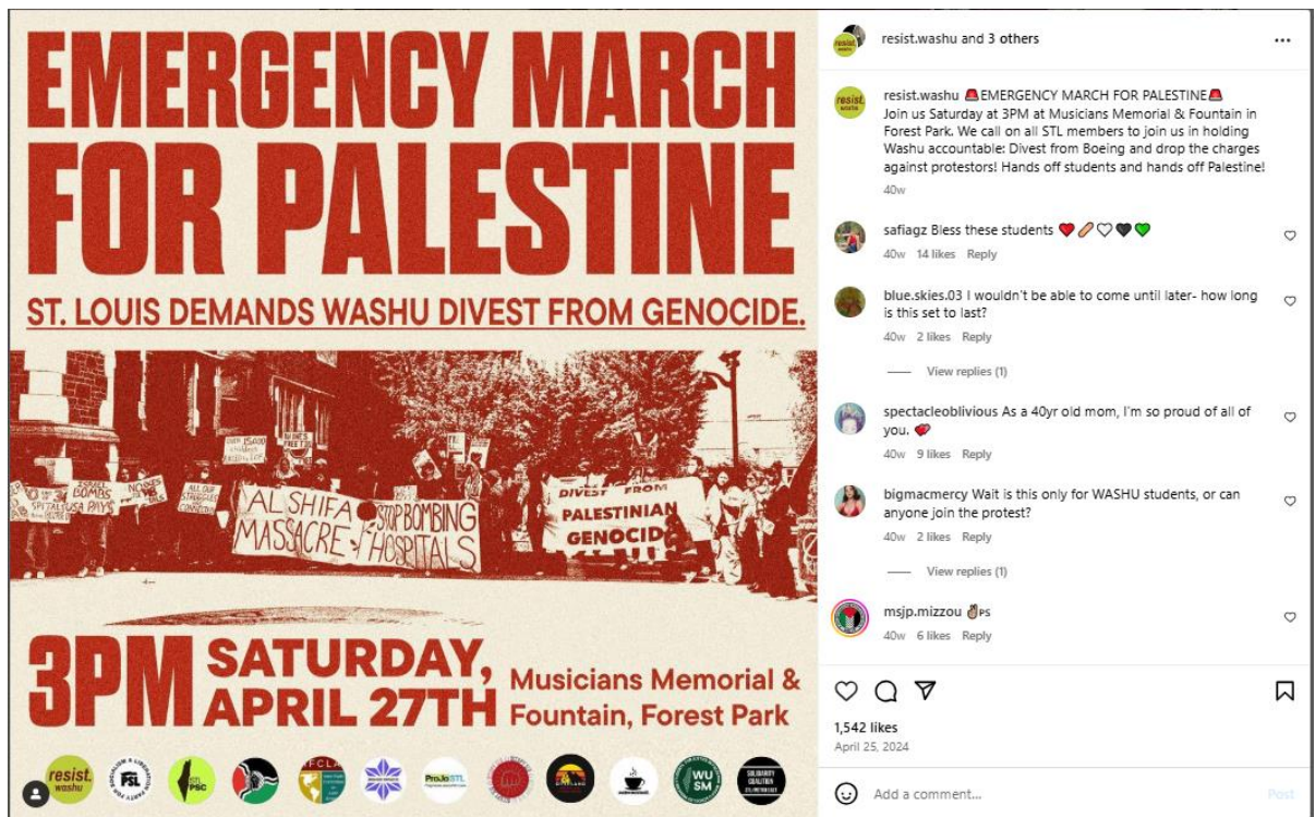
Screenshot of Emergency March Instagram post by @resist.washu.

During the week following the April 20, 2024 protest, there were indications that a bigger demonstration was being planned. On April 25, Resist WashU posted a flyer announcing an "Emergency March for Palestine" scheduled for 3:00 p.m. on April 27 in Forest Park and invited "the community" to join the march. The flyer featured logos of several other local activist groups. The Administration and WUPD also received intelligence from a number of law enforcement agencies and all were monitoring social media. The Administration believed the April 27 demonstration was going to be serious. It also remained deeply concerned about tents or an encampment being erected on campus. The WashU Administration was aware of protests occurring or expected at other university campuses, and was aware of other schools' responses, including, in at least one instance, barring tents without prior permission.